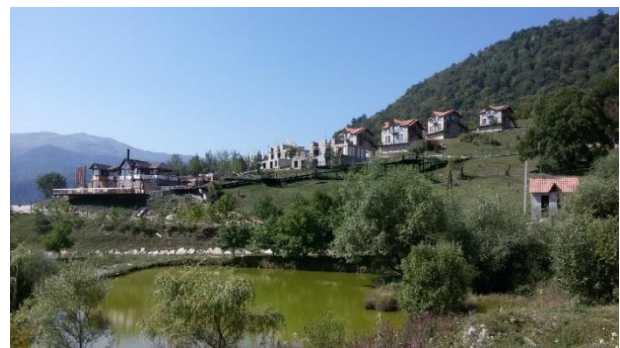
Fig. 6. Hotel Apaga Resort