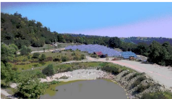
Fig. 5. 150 kW PV station in Yenokavan