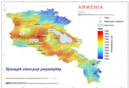
Fig. 1. Solar Energy Resources Map for Armenia