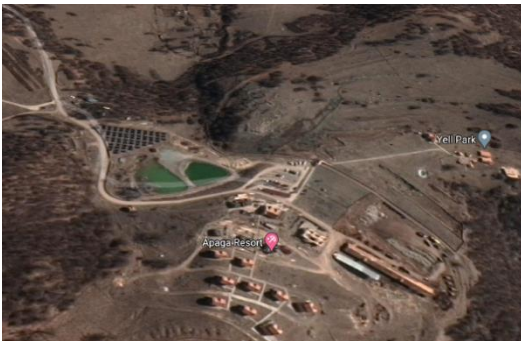
Fig. 3. Yenokan 150kW PV station, satellite view