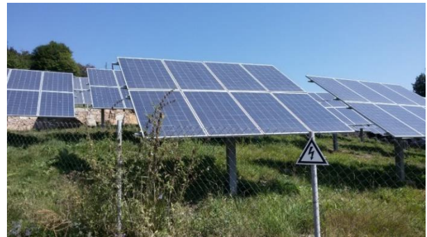
Fig. 4. PV panels of 150 kW PV station in Yenokavan